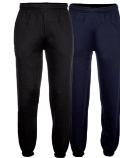
black navy blue