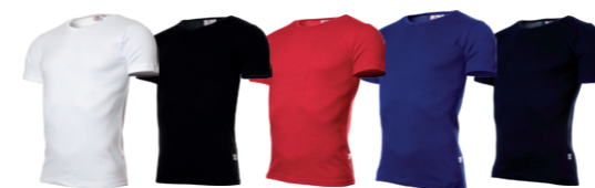
white black red royal blue navy blue