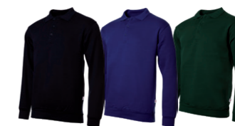
navy blue royal blue bottle green