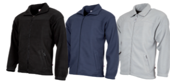
black navy blue sportgrey