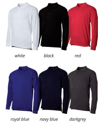
white black red royal blue navy blue darkgrey