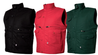
black red bottlegreen