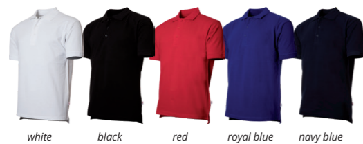
white black red royal blue navy blue