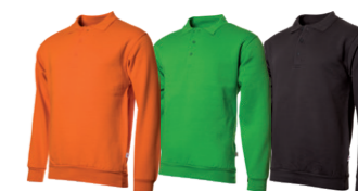
orange limegreen darkgrey