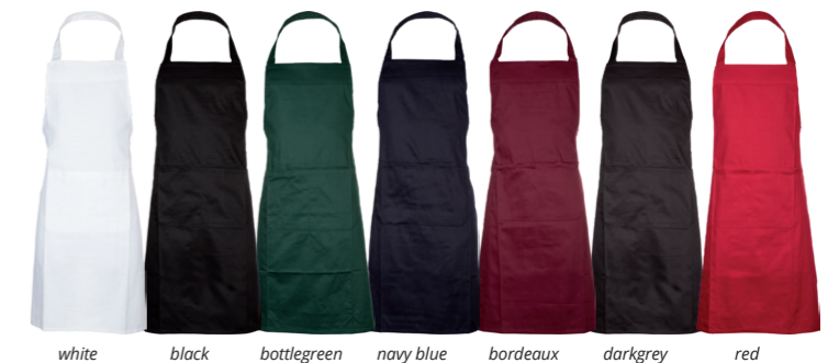
white black bottlegreen navy blue bordeaux darkgrey red