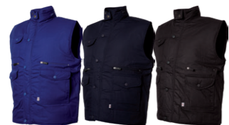
royal blue navy blue darkgrey