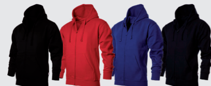
black red royal blue navy blue