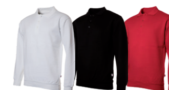
white black red