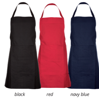
black red navy blue