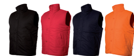
black red navy blue orange