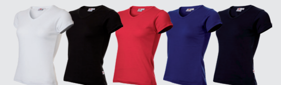
white black red royal blue navy blue